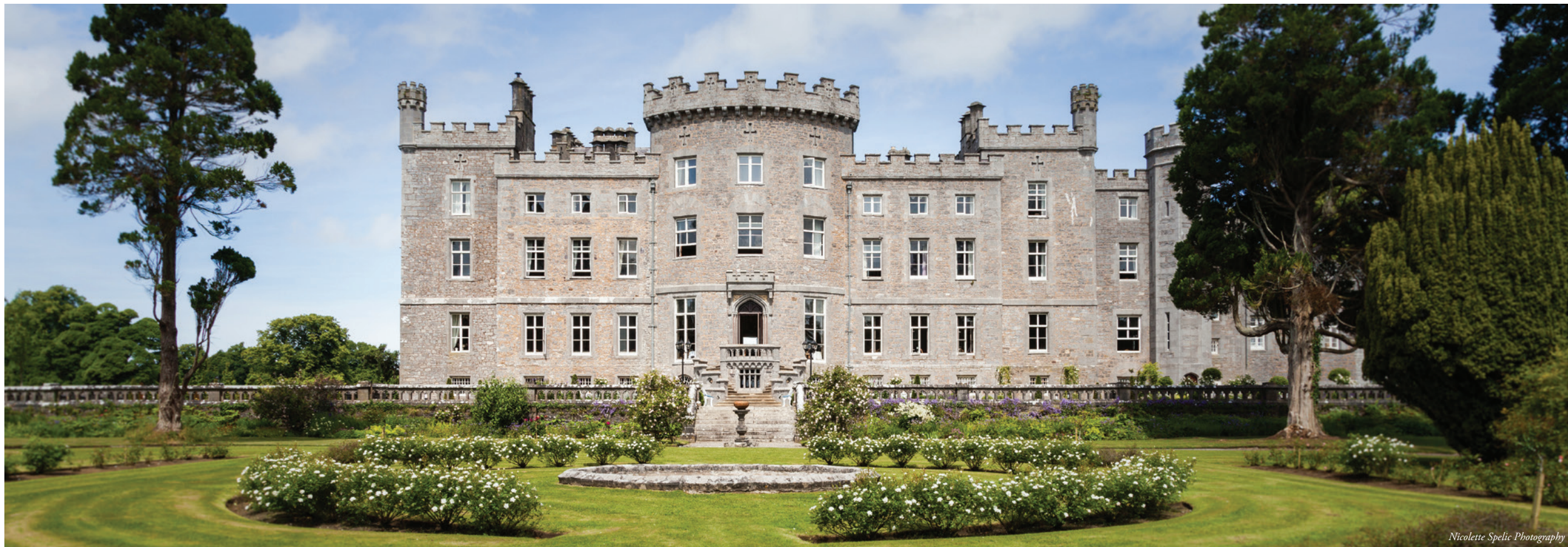
Nicolette Spelic Photography