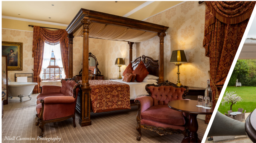
Niall Cummins Photography